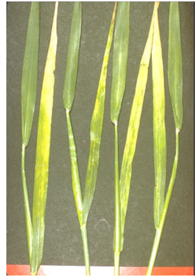
Figure 1. Plant showing soilborne wheat mosaic.

The virus also infects certain cultivars of fall-sown rye, barley, emmer, and spelt, wild annual brome grass ( Bromus commutatus ), sorghum, and some species of Chenopodium have been inoculated experimentally. Spring-sown wheats and most wild grasses appear to escape infection. The virus can remain infectious in dried leaves for several years or more. It is not transmitted through the seed or by insects, but it is transmitted by a soil-inhabiting fungus or mechanically at low rates.