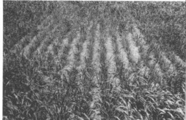
Figure 2. Area in wheat field of highly susceptible cultivar infected with soilborne wheat mosaic virus.

Two types of symptoms have been reported, chlorotic leaf mottling or mosaic and rosetting or stunting. Plants infected with the soilborne wheat mosaic virus usually appear in early spring as irregular patches of light green to bronze-yellow or light purple wheat within a field – depending on the cultivar, strain of the virus, and seasonal growing conditions. Severely diseased fields have an uneven appearance. The size and shape of infested areas will vary. The disease often occurs in poorly drained low areas and waterways in fields. A mosaic-infected area does not increase in size during the growing season. The infected area may increase over time due to tillage, land leveling, or flooding of fields. Wheat in the diseased area may be moderately to severely stunted in the early spring, but may recover later (Figure 2). Under conditions unfavorable for growth, however, infected plants remain dwarfed to maturity. Roots may be more severely stunted than shoots in some cultivars. Some plants may die, while others will produce fewer stems (culms) and heads. Maturity is often delayed. The heads on diseased plants may be shorter than normal heads and have shriveled, lightweight kernels.