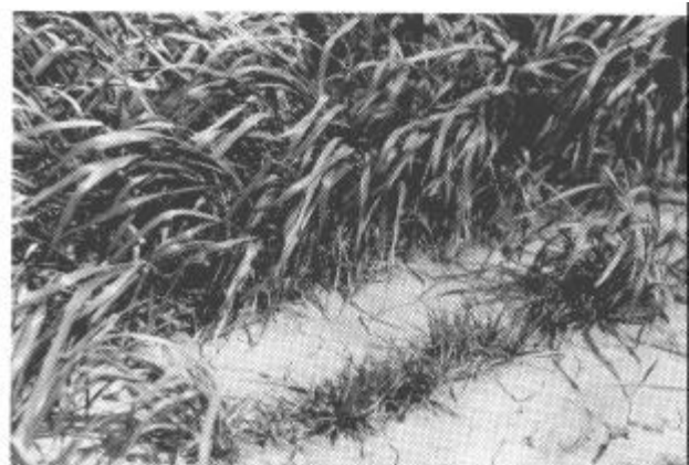
Figure 3. Rosette stage of soilborne wheat mosaic, foreground; wheat plants not infected, background.

A few strains of the virus cause rosetting in highly susceptible wheat cultivars. The leaves and tillers remain short, growth is bunched or compact, and tillering is excessive (Figure 3). The leaves of such plants are usually bluish green and may retain this color throughout the growing season. At other times, rosetted plants die early without developing much green color. Leaf mottling is usually not as pronounced in rosetted plants.