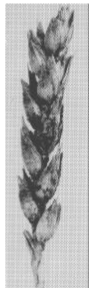
Fig. 3. Wheat head covered with perithecia of Gibberella zeae .

Poor stands are common from sowing scab-infected seed. Scabby kernels are often dead, or else germinate weakly. If a sprout manages to emerge from the soil, it frequently decays before it can become established.