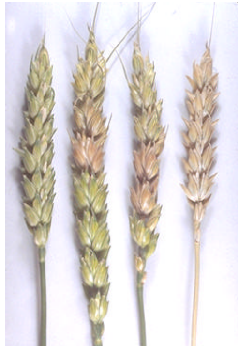
Figure 1. Left, healthy; and right, three scab-infected wheat heads.

SCAB OR HEAD BLIGHT. In the field, the earliest and most conspicuous symptom of scab infection occurs soon after flowering. Diseased wheat spikelets become a bleached, light-straw color and ripen prematurely, while healthy spikelets are still a normal green. Diseased wheat kernels are grayish brown and lightweight. Scab-infected rye kernels are dark brown to carmine-red. If the entire head is infected, barley spikes are dwarfed; diseased spikelets are compressed rather than spreading. Scab-infected